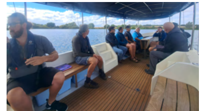
Some photos from the day