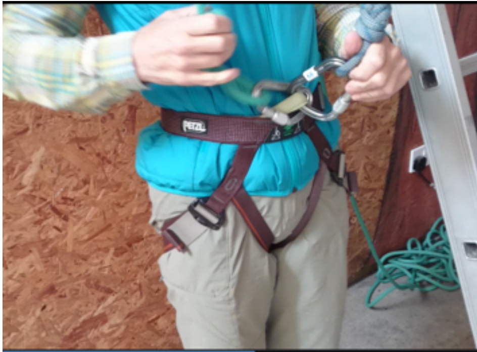
Picture 2 – showing the karabiner on the trolley lanyard (green rope) has been clipped across and behind the karabiner on the safety rope (blue rope).

clipped the karabiner of the trolley lanyard (green rope) across and behind the safety rope karabiner (blue rope) as shown in Picture 2 below.