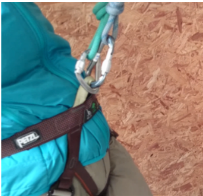
Picture 3 – showing how the trolley lanyard karabiner begins to slip over the safety rope karabiner.

The instructor returned to the ground and the child set off along the zip wire, but fell to the ground a little way from the start as the trolley karabiner slid over the safety rope karabiner, as shown in picture 3 below.