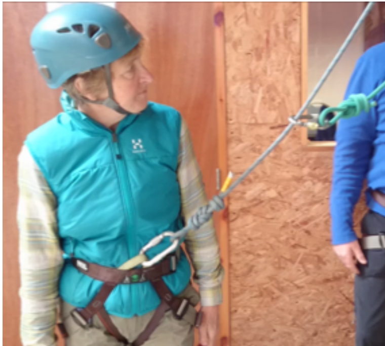
Picture 4 – showing the trolley lanyard karabiner completely slipped over safety rope karabiner and safety rope knot.

It continued to slip over the knot of the safety rope and thus became ineffective and the child consequently fell.