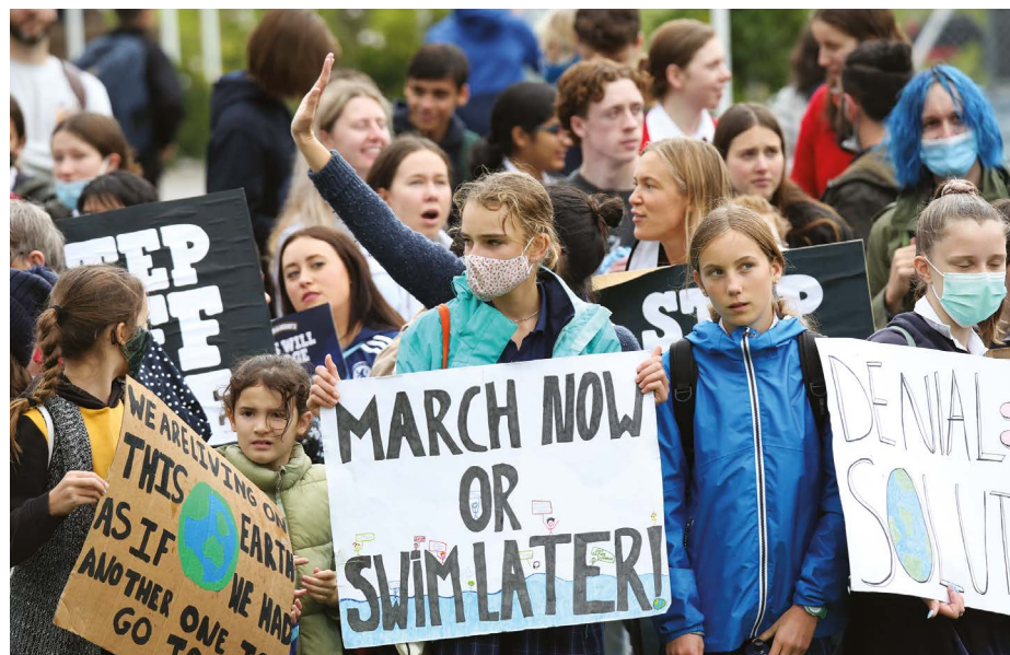
Children at a School Strike for Climate protest in Sydney, Australia.

"I think this research will impact more audiences than other arguments about why we should do more on climate."